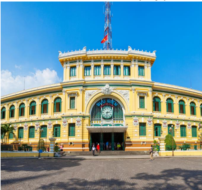
Central Post Office

Back to Saigon and wind through District One before heading to the famous Saigon landmarks, the Cathedral of Notre Dame as well as the Centre Post Office and pass by the ornate City Hall (Hotel De Ville) and old Opera House . Visit The Unification Palace which formerly was Independence palace of the South Vietnamese President. The end of day trip, you will free shopping at Ben Thanh market .