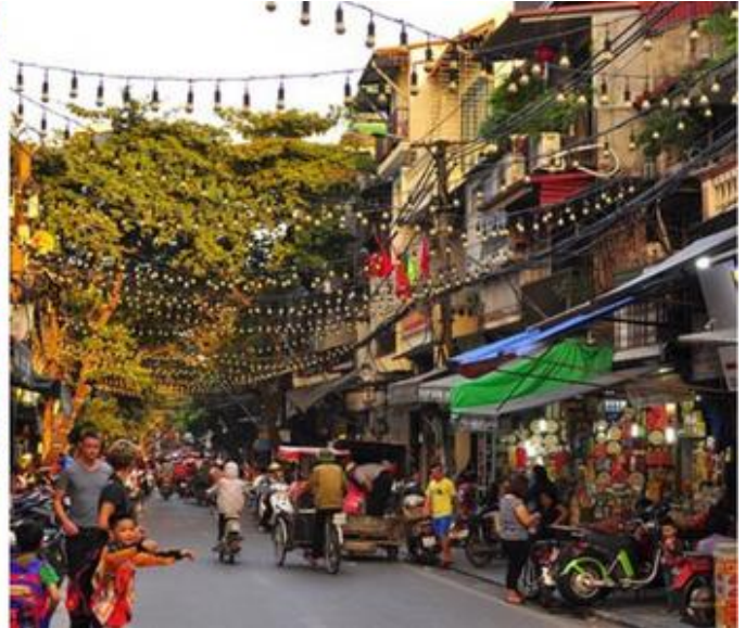
Ha Noi Old Quarter