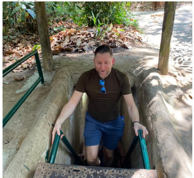
Cu Chi Tunnels