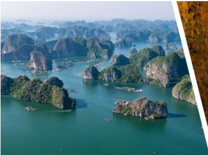
The overview of Ha Long Bay

After breakfast at hotel, coach and guide will pick up and transfer to Halong Bay . We arrive at Bai Chay wharf, welcome by crew team and we start enjoying 3.5 - 04 hours boat trip.