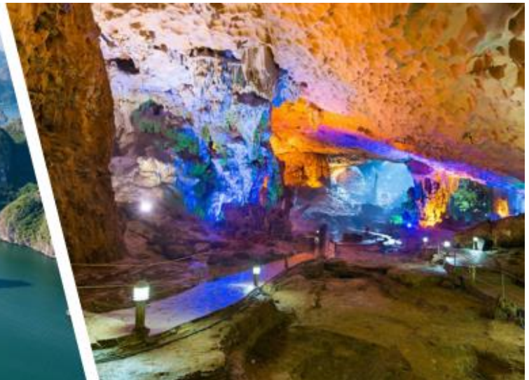
Thien Cung cave