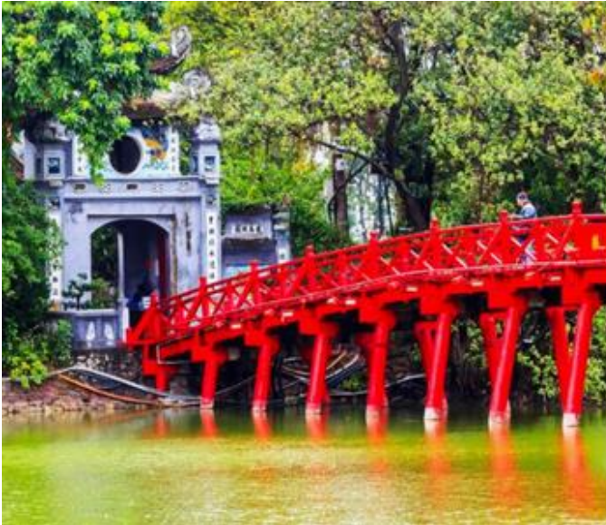
Hoan Kiem Lake